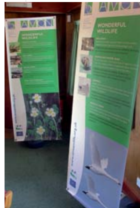
Panels from a project exhibition

and flow deflectors in the water. Wooden posts were driven into the riverbed in specific shapes and filled with woody material. These structures collected sediment and developed often significant plant life, providing shelter and habitat for numerous species. At other sites, whole trees were fixed in place in the watercourse. Other approaches tried at different sites included fixing trees in the watercourse, adding stones and gravel at strategic locations along the edge of the river and even pushing raised riverbanks back into the river course.