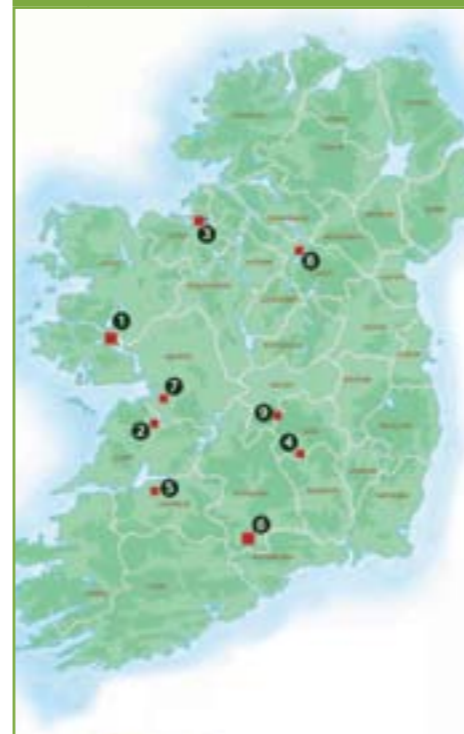
Site map – Ireland Priority Woodland Locations