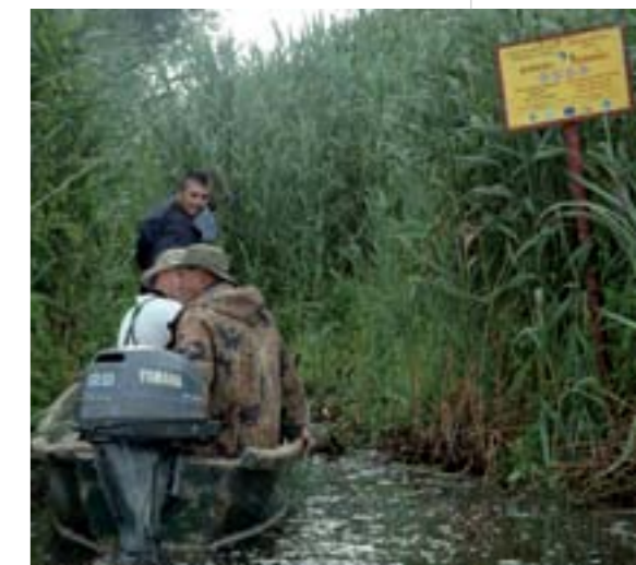
Pelican colony sign and wardens

Another positive outcome of the project was the designation of all six breeding sites covered as Natura 2000 network Special Protection Areas (SPAs). However, the approval of the main strategic documents for future conservation management – a management plan, designation of the sites as core areas within the Danube Delta and a national action plan – is still pending.