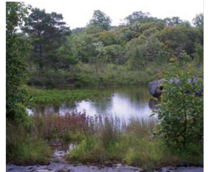
Ash/ hazel natural woodland associated with limestone pavement at the Clonbur 'demonstration site' on the Galway / Mayo border