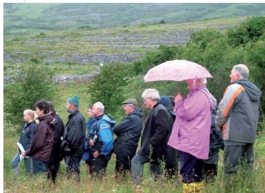
Nineteen of the original BLP farmers are now participating in the new programme

Meanwhile, at the start of the BLP in 2004, a rigorous process was used to select the 20 pilot farms representative of the diversity inherent in the Burren – from 40 ha to over 400 ha – and ranging in conservation status from "favourable" to "very unfavourable", with some farms almost completely overgrown with scrub.