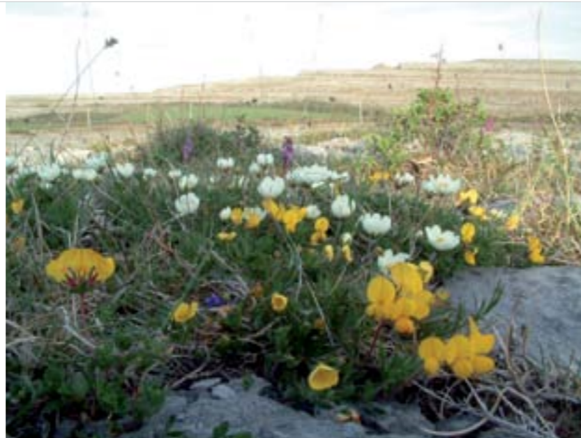
Limestone heaths are common in the Burren, where they contain a wonderful mixture of acid-loving and lime-loving plants

A pilot project of this nature requires a considerable amount of preparation and monitoring in order to ensure that the pilot mechanisms would be transferable to the whole Burren farmland region. These preparations, covering the first three years of the project, included: (i) talking to the local farmers and generating support for the scheme; (ii) selection of the pilot farms; and (iii) the drawing up farm management plans for each of the selected sites.