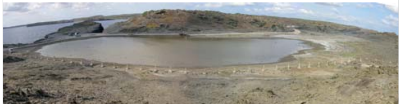
The LIFE project implemented management plans for the Natura 2000 sites with temporary pond habitats

Studies carried out for the LIFE project also showed that the Mediterranean tree frog ( Hyla meridionalis ) and the Balearic green toad ( Bufo balearicus ) – species of European Community interest listed in Annex IV of the Habitats Directive – are compatible and don't suffer from inhabiting the same pond. The population of the toad is decreasing in Minorca, however, and "conservation of the ponds is very important for