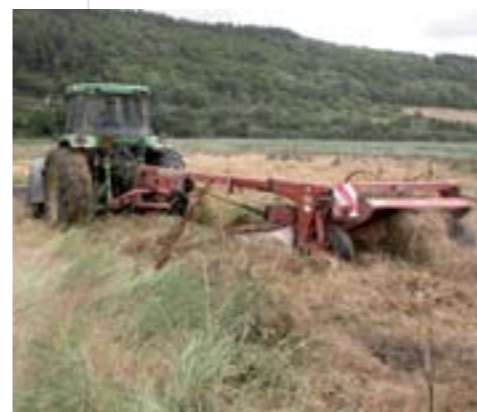
Cutting of invasive plant species

To address this issue, the "Acrocephalus Bretagne" project (LIFE04 NAT/FR/000086) set out to maintain or improve the ecological status of three important stopover marshes in Brittany and to disseminate the know-how gained to other coastal marsh restoration efforts. Knowledge of the species would be improved through radio-tracking and by carrying out an inventory of additional spring migratory stopover sites.