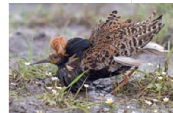
Ruff - one of the bird species helped by this project

Although the various actions taken have not yet successfully stopped the decline in numbers of breeding meadow birds at the four project sites, it is hoped that there will be a notable positive long-term effect. Funding for the installations established during the REMAB project will continue at