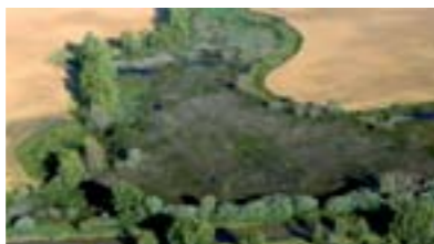
The conservation status of the wetlands has been improved thanks to the actions of this LIFE Nature project

The Canal de Castilla is a 207 km-long canal built in the 18 th century to connect the Castilian plains with the sea. In the 20 th century the canal fell into disuse and became a haven for wildlife: the area covered by the canal includes La Nava-Campos Norte and La Nava-Campos Sur: two special protected areas (SPAs) that are of great importance for the steppe birds of Palencia province.