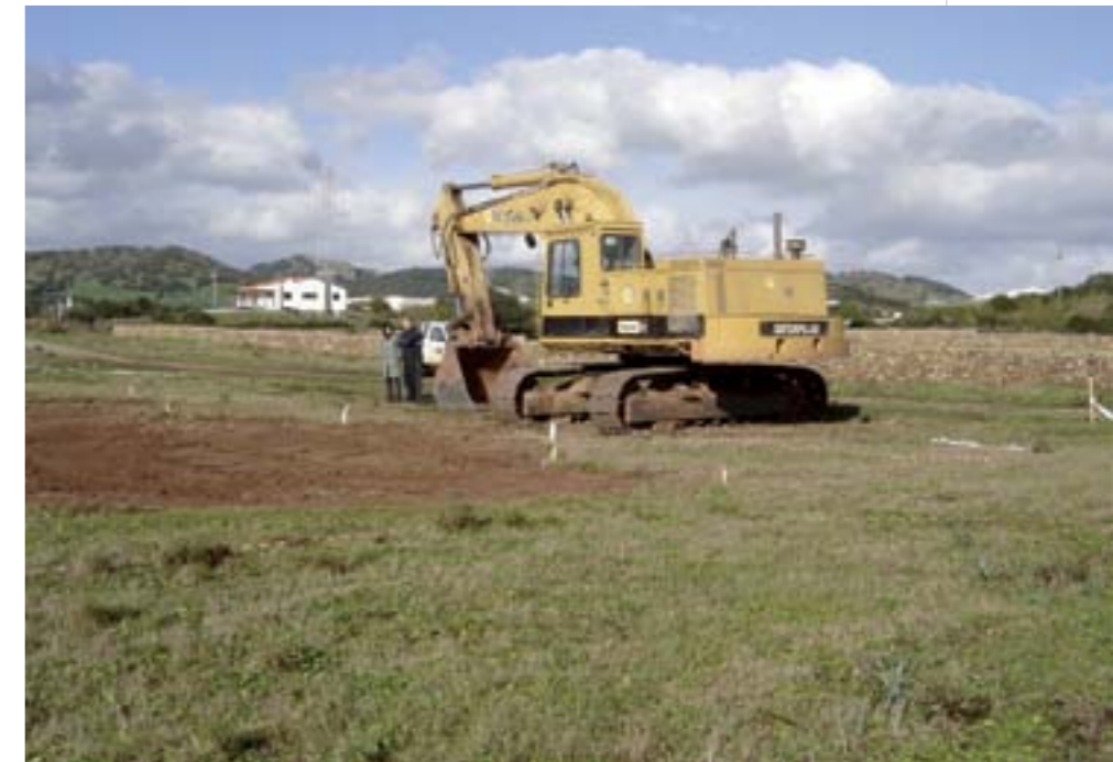
Excavation of an experimental temporary pond for educational purposes in Santa Eularieta