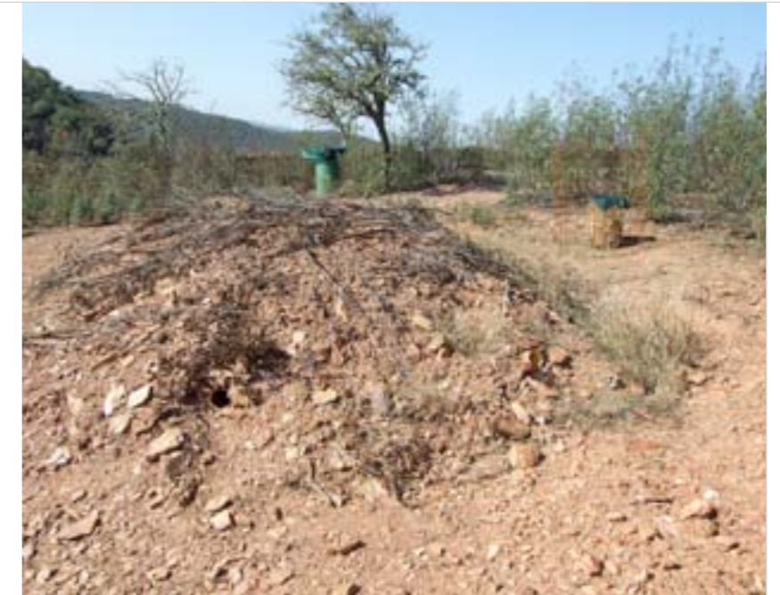
Rabbit "nest" protection site built by the project

Actions were taken to create better conditions for the rabbit population, including the sowing of 60 ha of pastures to improve feeding conditions and the installation of 100 rabbit shelters, 72 water suppliers, 15 watering points and 120 feeders. The project team also created areas of natural refuge by planting and seeding more than 3 000 plants of typical native species (holm oak, cork trees, strawberry trees, Italian buckthorn and oleaster) and by protecting