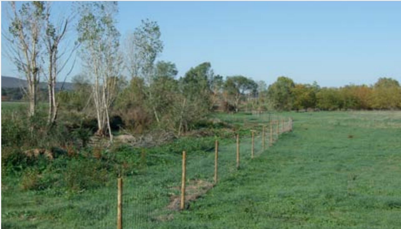
Fences were erected to restore riparian vegetation by keeping grazing livestock away from the banks of streams

Looking back, he considers the public participation aspect (which also included such dissemination activities as posters, leaflets, a website, guided field visits and lectures at fairs, universities and schools) as a major achievement in a region often adverse to nature conservation issues and Natura 2000. "It was a very important tool - It was one of the most important actions of the project with some of the best results," believes Mr. Santos. "It's something we are still trying to do right now... being able to work with people - landowners, hunters and farmers - and having their trust and being able to develop partnership agreements with them. To show that it is possible to work together with the common goal of conserving the habitats of species such as the Iberian lynx."