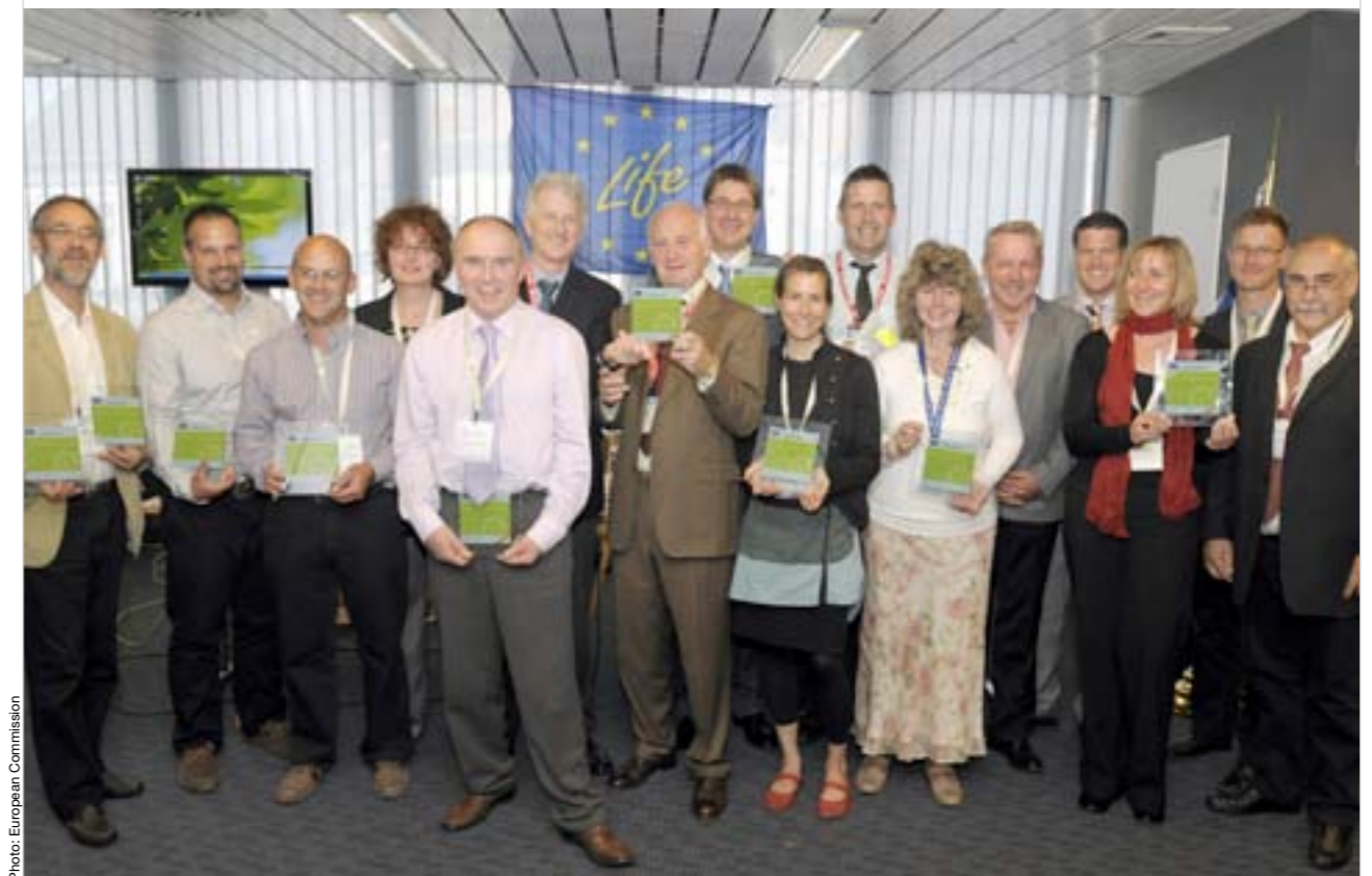
The winners gather at the LIFE Nature Best Awards ceremony, held at the European Commission in Brussels during Green Week 2011

The EU Member States represented on the LIFE Committee and the European Commission's LIFE Nature Unit have announced the Best LIFE Nature Projects 2010. The 18 projects selected represent the most successful of the recently completed LIFE Nature projects, in terms of best practices and/or demonstration actions on nature conservation and the implementation of the Habitats and Birds Directives