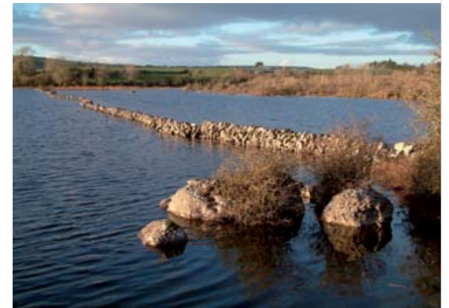
Turloughs are disappearing lakes, formed where a limestone depression is intermittently flooded, generally in winter. They are normally filled through underground springs and holes

The project monitored the outcome of its actions on priority habitats, water