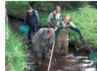
Inventories of habitat condition and species status provided a crucial baseline for project actions

Much of the LIFE project's co-finance was invested in testing and demonstrating new techniques for restoring the headwater