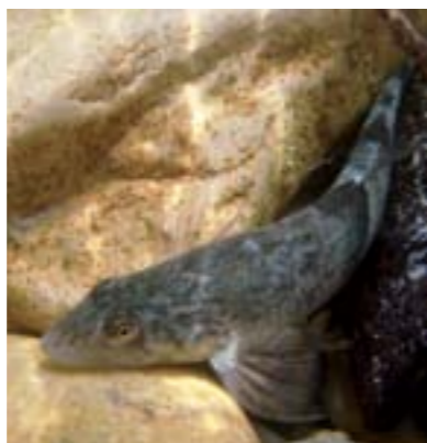
Rhône streber ( Zingel asper )

The Rhône streber ( Zingel asper ), also known as Rhône-Apron, is a fish of the perch family, only found in the Rhône river catchment. It is in critical danger of extinction. Its population declined seriously during the 20th century, falling from an estimated presence along 2 200 km of rivers to 380 km today. The main cause of this decline has been hydraulic engineering works such as dams that have created barriers and thus isolated sub-populations of the species from each other. River pollution and flow changes resulting from water abstraction for agricultural purposes have also led to a severe degradation of the fish's habitat.